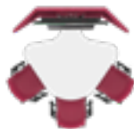
Plectrum Reverse 3 & 5 seat

Please note, these are our recommended worktop shapes. We are happy to discuss other requirements. MAXIMUM 1240mm(W) screen size