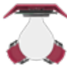
Teardrop 2 seat