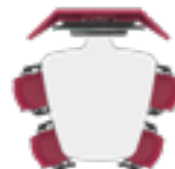
Blade 4, 5 & 6 seat