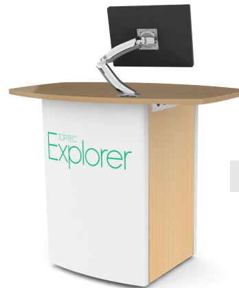
Deluxe panel option