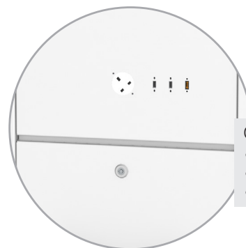
Customisable connectivity • USB • HDMI • 13A socket • Aperture for control panel