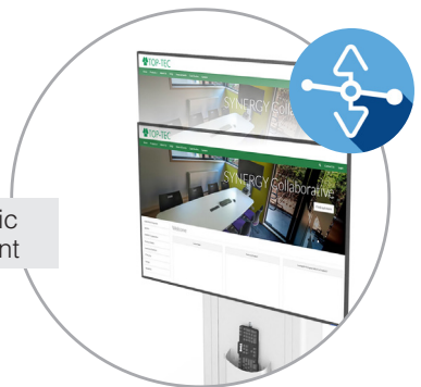
Gravity or electric height adjustment